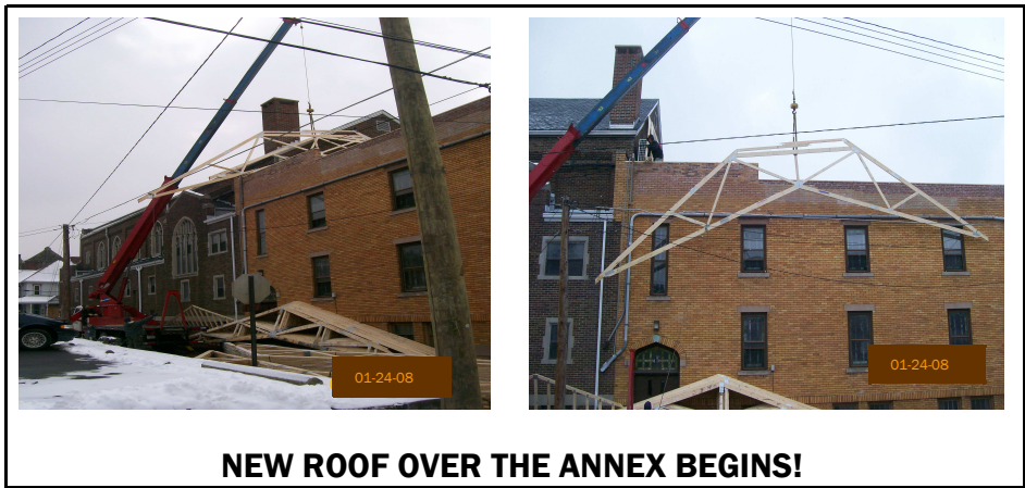
NEW ROOF OVER THE ANNEX BEGINS!